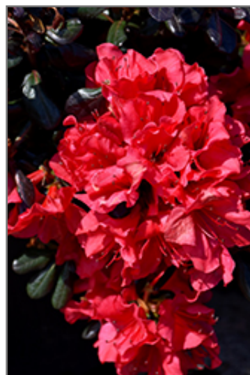
Johanna Azalea flowers