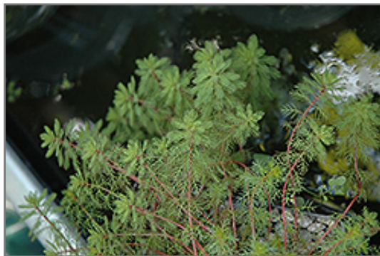
Red Stemmed Parrot Feather foliage