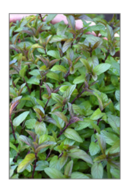
Chocolate Mint foliage

Chocolate Mint features bold spikes of lavender tubular flowers rising above the foliage in mid summer. Its attractive fragrant oval leaves remain green in colour throughout the season.