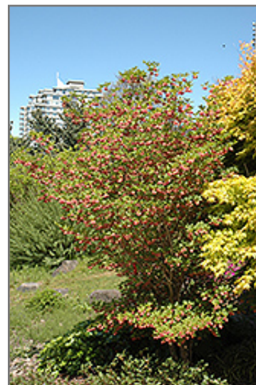
Redvein Enkianthus in bloom