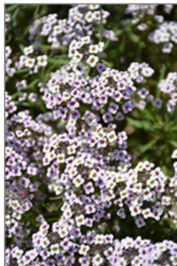
Blushing Princess Sweet Alyssum flowers

This plant will require occasional maintenance and upkeep, and should not require much pruning, except when necessary, such as to remove dieback. It is a good choice for attracting bees and butterflies to your yard, but is not particularly attractive to deer who tend to leave it alone in favor of tastier treats. It has no significant negative characteristics.