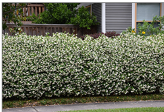
Confederate Star-Jasmine in bloom