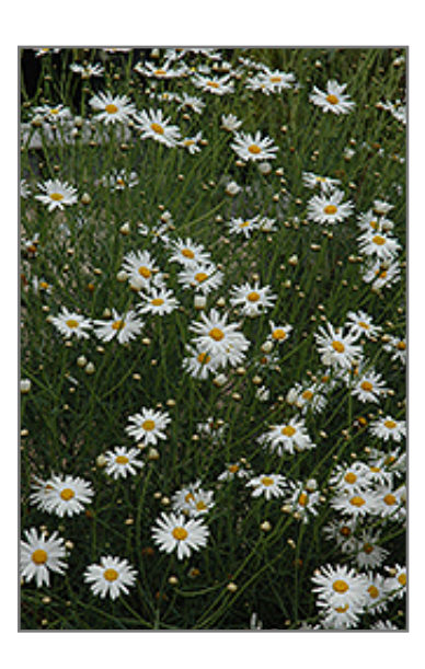
Marguerite Daisy in bloom

Marguerite Daisy has masses of beautiful white daisy flowers with yellow eyes at the ends of the stems from early to late summer, which are most effective when planted in groupings. The flowers are excellent for cutting. Its tiny deeply cut ferny leaves remain grayish green in colour throughout the year.