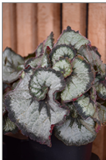
Escargot Begonia foliage