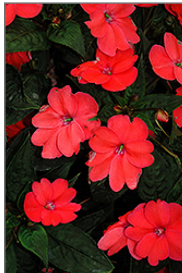
SunPatiens Compact Coral New Guinea Impatiens flowers

SunPatiens Compact Coral New Guinea Impatiens is recommended for the following landscape applications;