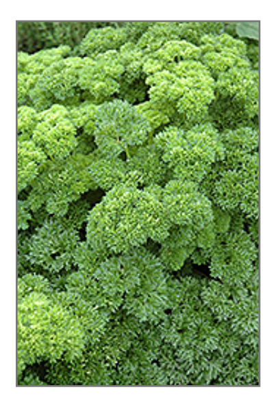
Parsley foliage

This is a dense herbaceous perennial herb with a mounded form. Its relatively fine texture sets it apart from other garden plants with less refined foliage. This is a high maintenance plant that will require regular care and upkeep, and is best cleaned up in early spring before it resumes active growth for the season. It has no significant negative characteristics.