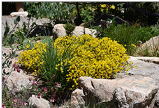
Vancouver Gold Woadwaxen in bloom