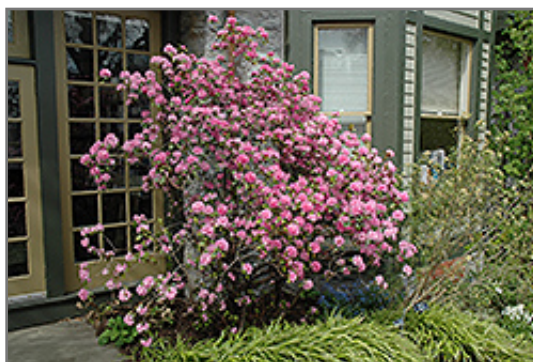
Olga Mezitt Rhododendron in bloom