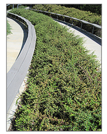
Bearberry Cotoneaster

This shrub will require occasional maintenance and upkeep, and should not require much pruning, except when necessary, such as to remove dieback. Deer don't particularly care for this plant and will usually leave it alone in favor of tastier treats. Gardeners should be aware of the following characteristic(s) that may warrant special consideration;