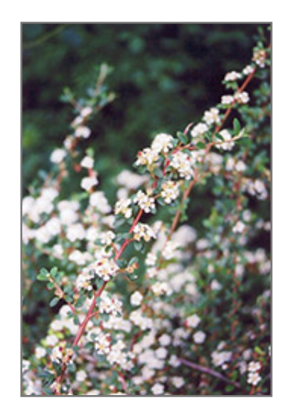
Bearberry Cotoneaster flowers