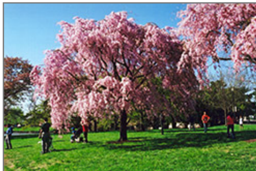
Pink Weeping Higan Cherry in bloom