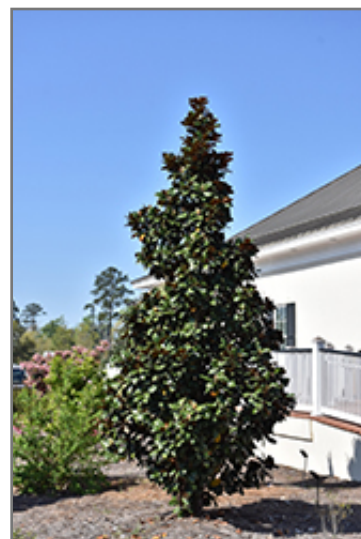
Teddy Bear Magnolia