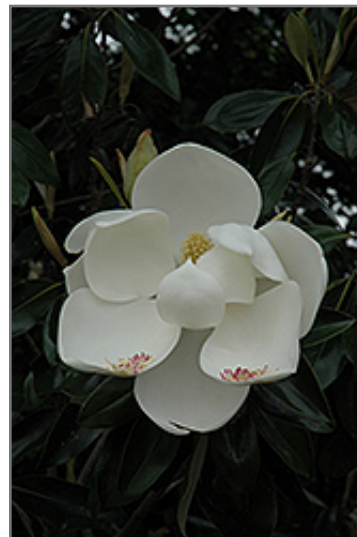
Teddy Bear Magnolia flowers