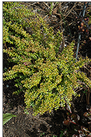
Twiggy Box Honeysuckle