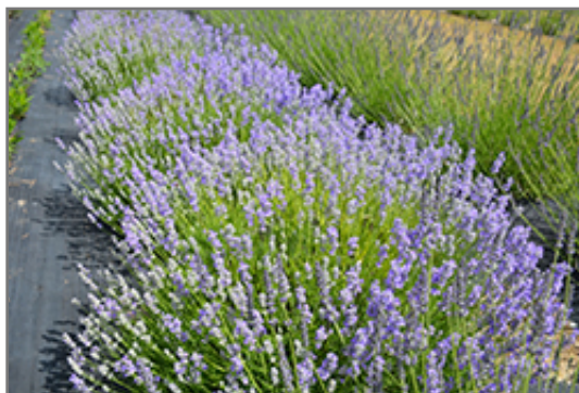
Blue Cushion Lavender in bloom