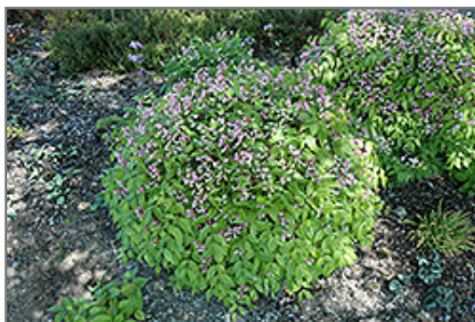
Spring Vetchling in bloom