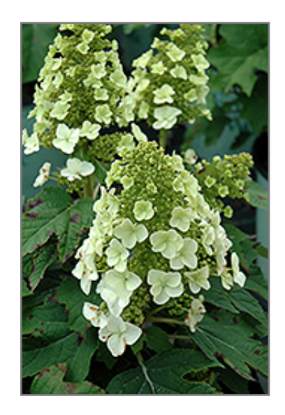
Munchkin Hydrangea flowers

Munchkin Hydrangea is recommended for the following landscape applications;