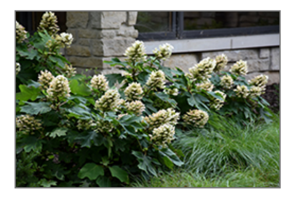
Munchkin Hydrangea flowers