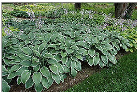
Winter Snow Hosta in bloom