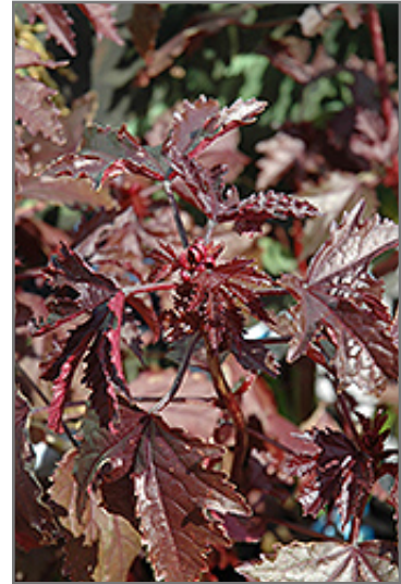
Burgundy Aquarius Hibiscus foliage

Burgundy Aquarius Hibiscus is recommended for the following landscape applications;