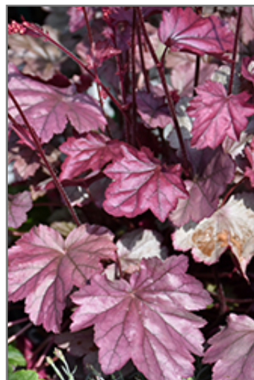
Stainless Steel Coral Bells foliage

Stainless Steel Coral Bells is recommended for the following landscape applications;