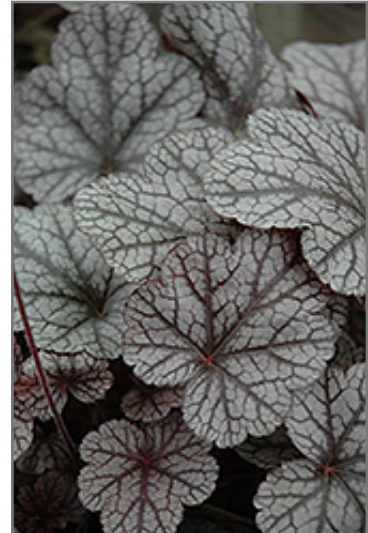
Prince Of Silver Coral Bells foliage

Prince Of Silver Coral Bells is recommended for the following landscape applications;