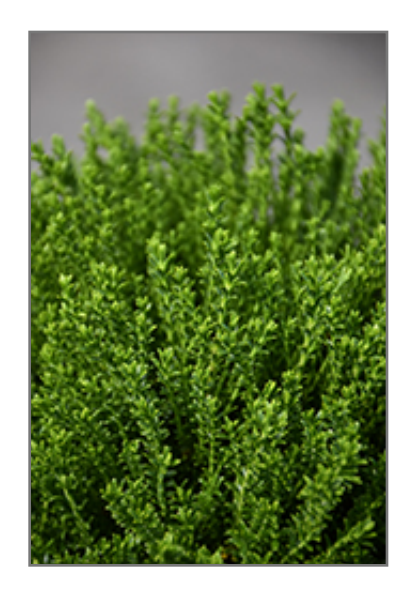
McKeanii Hebe foliage