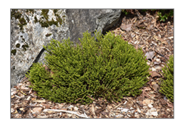
McKeanii Hebe

A lovely evergreen upright shrub with rounded, bright green glossy leaves; white flowers are impressive in mid to late summer; will tolerate some mild frost, but should be sheltered