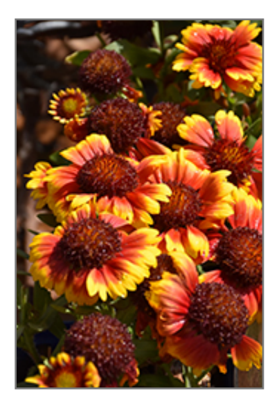
Gallo Fire Blanket Flower flowers

Height: 16 inches Spread: 18 inches Spacing: 15 inches Sunlight: O Hardiness Zone: 5a Other Names: Blanketflower, Indian Blanket Group/Class: Gallo Series Description: