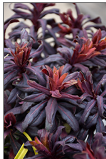
Ruby Glow Wood Spurge flowers

This is a relatively low maintenance plant, and should only be pruned after flowering to avoid removing any of the current season's flowers. Deer don't particularly care for this plant and will usually leave it alone in favor of tastier treats. It has no significant negative characteristics.