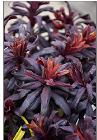
Ruby Glow Wood Spurge flowers

This is a relatively low maintenance plant, and should only be pruned after flowering to avoid removing any of the current season's flowers. Deer don't particularly care for this plant and will usually leave it alone in favor of tastier treats. It has no significant negative characteristics.