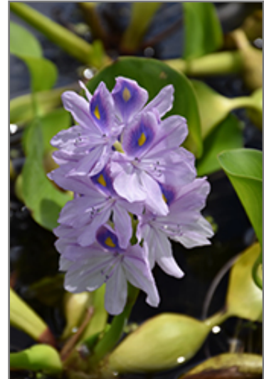
Water Hyacinth flowers

Water Hyacinth is recommended for the following landscape applications;