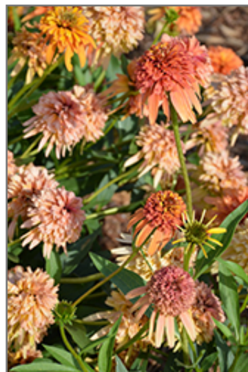
Cone-fections Marmalade Coneflower flowers