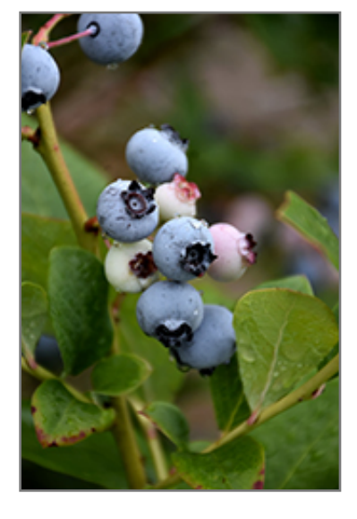
Spartan Blueberry fruit

A vigorous variety with sweetly-flavored light blue fruit in early mid-season and pretty bell-shaped flowers, bushy and compact with an orange-yellow fall color; blueberries need highly acidic soil, perfect drainage and mulch; plant with peat moss