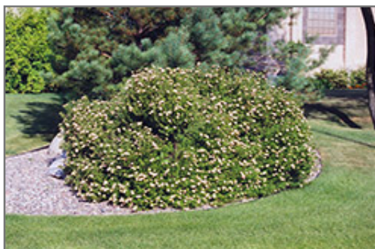
Pink Beauty Potentilla in bloom