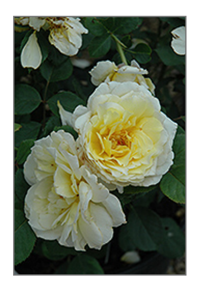
White Licorice Rose flowers

This shrub will require occasional maintenance and upkeep, and is best pruned in late winter once the threat of extreme cold has passed. It is a good choice for attracting bees to your yard. Gardeners should be aware of the following characteristic(s) that may warrant special consideration;