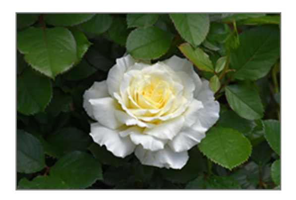
White Licorice Rose flowers

Beautiful pastel blooms of ivory and cream, with soft yellow centers, with a head turning fragrance of sweet licorice and lemons; blooms repeat all season long and make splendid cut flowers