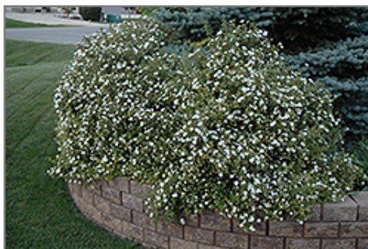
Abbotswood Potentilla in bloom