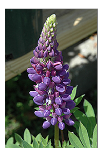
Gallery Blue Lupine flowers