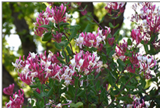
Peaches And Cream Honeysuckle flowers

Peaches And Cream Honeysuckle will grow to be about 20 feet tall at maturity, with a spread of 24 inches. As a climbing vine, it tends to be leggy near the base and should be underplanted with low-growing facer plants. It should be planted near a fence, trellis or other landscape structure where it can be trained to grow upwards on it, or allowed to trail off a retaining wall or slope. It grows at a medium rate, and under ideal conditions can be expected to live for approximately 20 years.