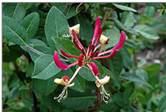
Peaches And Cream Honeysuckle flowers

This woody vine will require occasional maintenance and upkeep, and is best pruned in late winter once the threat of extreme cold has passed. It is a good choice for attracting butterflies and hummingbirds to your yard. It has no significant negative characteristics.