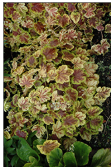
Solar Eclipse Foamy Bells