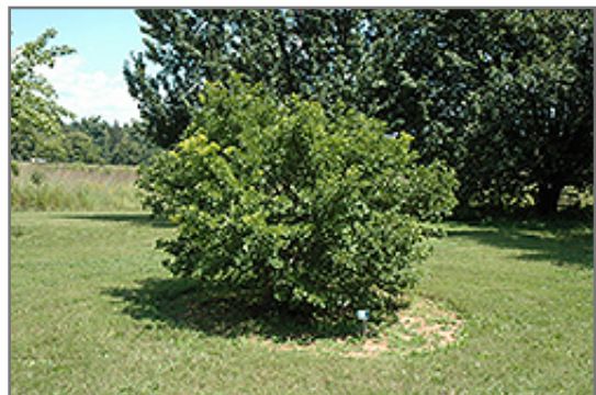
Jade Butterflies Ginkgo