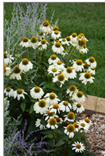
PowWow White Coneflower in bloom