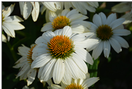
PowWow White Coneflower flowers

This is a relatively low maintenance plant, and is best cleaned up in early spring before it resumes active growth for the season. It is a good choice for attracting birds and butterflies to your yard, but is not particularly attractive to deer who tend to leave it alone in favor of tastier treats. It has no significant negative characteristics.