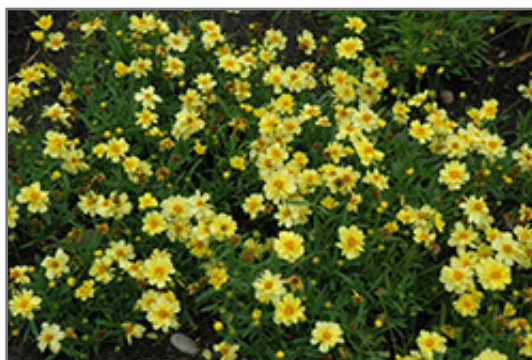
Galaxy Tickseed in bloom