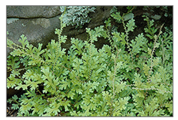
Peacock Spikemoss foliage