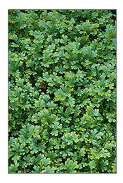
Peacock Spikemoss

Peacock Spikemoss is recommended for the following landscape applications;