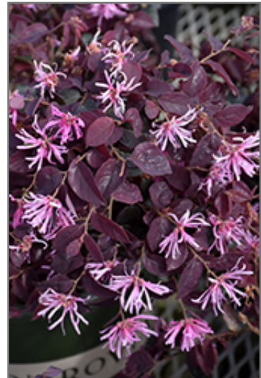
Sizzling Pink Chinese Fringeflower flowers