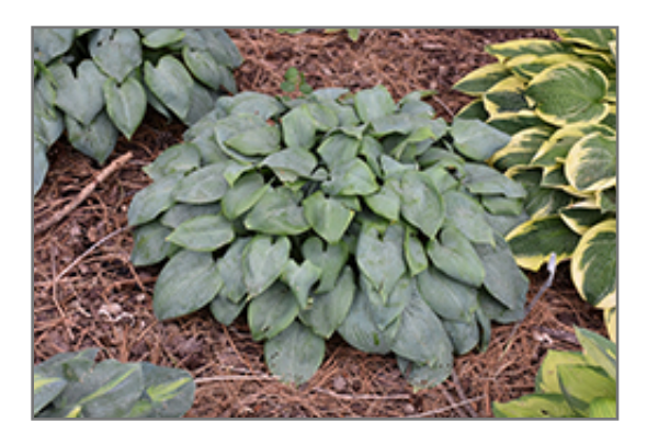
Fragrant Blue Hosta