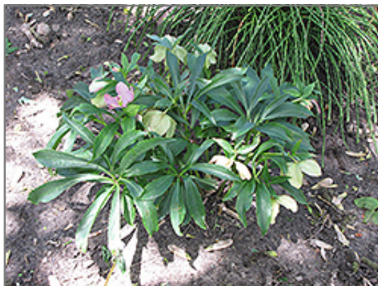
Winter Jewels Cherry Blossom Hellebore in bloom