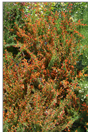
Lena Scotch Broom in bloom

This shrub should only be grown in full sunlight. It prefers dry to average moisture levels with very well-drained soil, and will often die in standing water. It is considered to be drought-tolerant, and thus makes an ideal choice for xeriscaping or the moisture-conserving landscape. It is particular about its soil conditions, with a strong preference for clay, alkaline soils, and is able to handle environmental salt. It is highly tolerant of urban pollution and will even thrive in inner city environments. This particular variety is an interspecific hybrid.