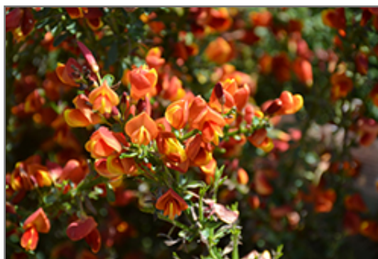
Lena Scotch Broom flowers