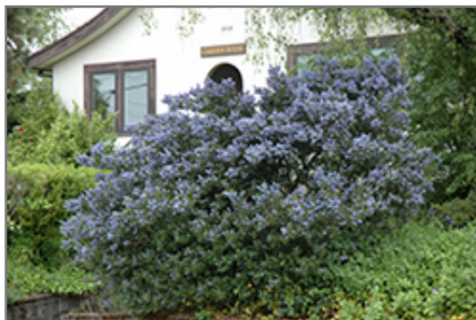
Victoria California Lilac in bloom