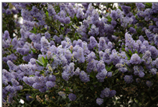
Victoria California Lilac flowers

This is a relatively low maintenance shrub, and should only be pruned after flowering to avoid removing any of the current season's flowers. It is a good choice for attracting bees and butterflies to your yard, but is not particularly attractive to deer who tend to leave it alone in favor of tastier treats. Gardeners should be aware of the following characteristic(s) that may warrant special consideration;