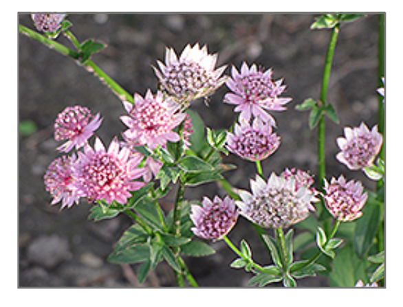
Primadonna Masterwort flowers

This plant will require occasional maintenance and upkeep, and should be cut back in late fall in preparation for winter. Gardeners should be aware of the following characteristic(s) that may warrant special consideration;