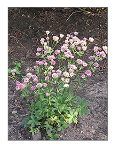
Primadonna Masterwort in bloom