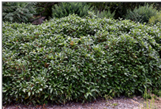
David Viburnum

This shrub does best in partial shade to shade. It prefers to grow in average to moist conditions, and shouldn't be allowed to dry out. It is not particular as to soil type or pH. It is highly tolerant of urban pollution and will even thrive in inner city environments. This species is not originally from North America.