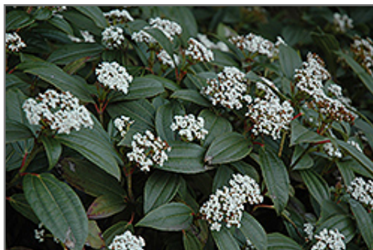
David Viburnum flowers