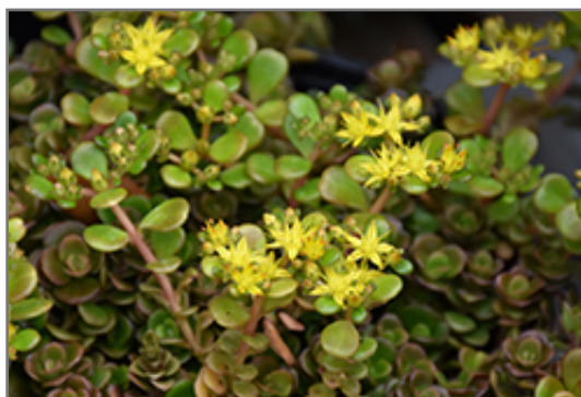
Chinese Sedum flowers