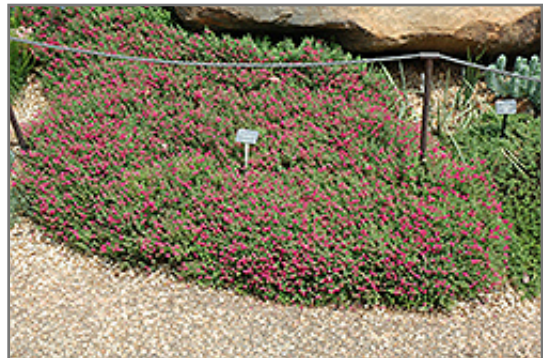
Texas Rose Pink Skullcap in bloom