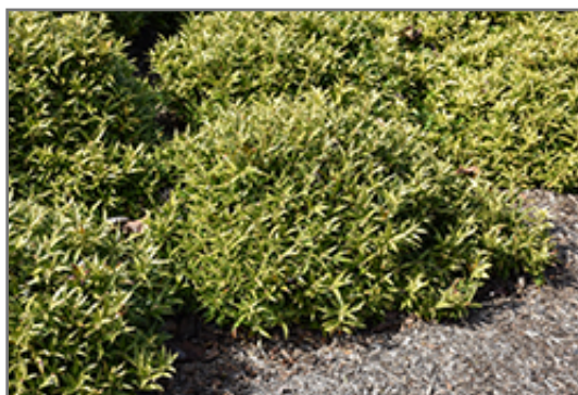
Dwarf Sweet Box