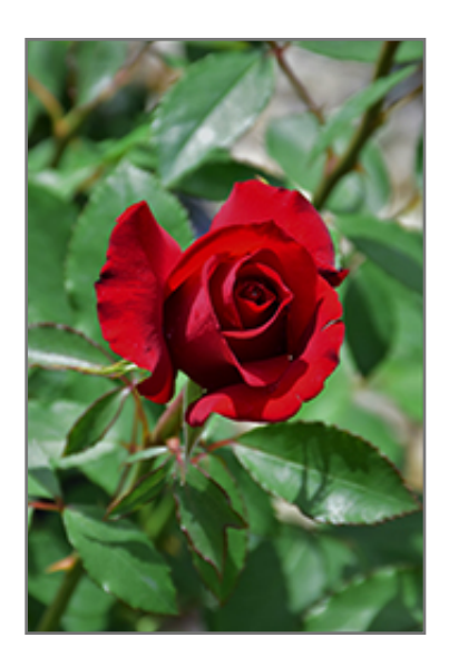
Opening Night Rose flowers

Opening Night Rose is recommended for the following landscape applications;