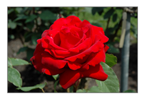
Opening Night Rose flowers

A stunning variety with sumptuous deep red velvety blooms that have a glowing brightness; long stems are great for cutting; gorgeous in the garden or a vase